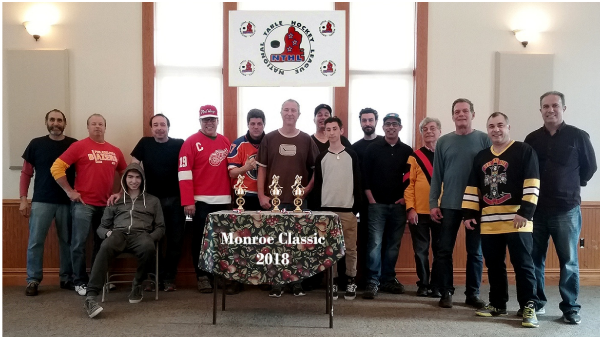
Monroe, NY, March 24th, 2018: Inaugural Monroe Classic

The first edition of the Monroe Classic, organized by the living legend of table hockey Lou Marinoff, gets good press. The modest field of 16 participants was largely offset by great camaraderie, intense competition between players, and a most pleasant small town ambience.