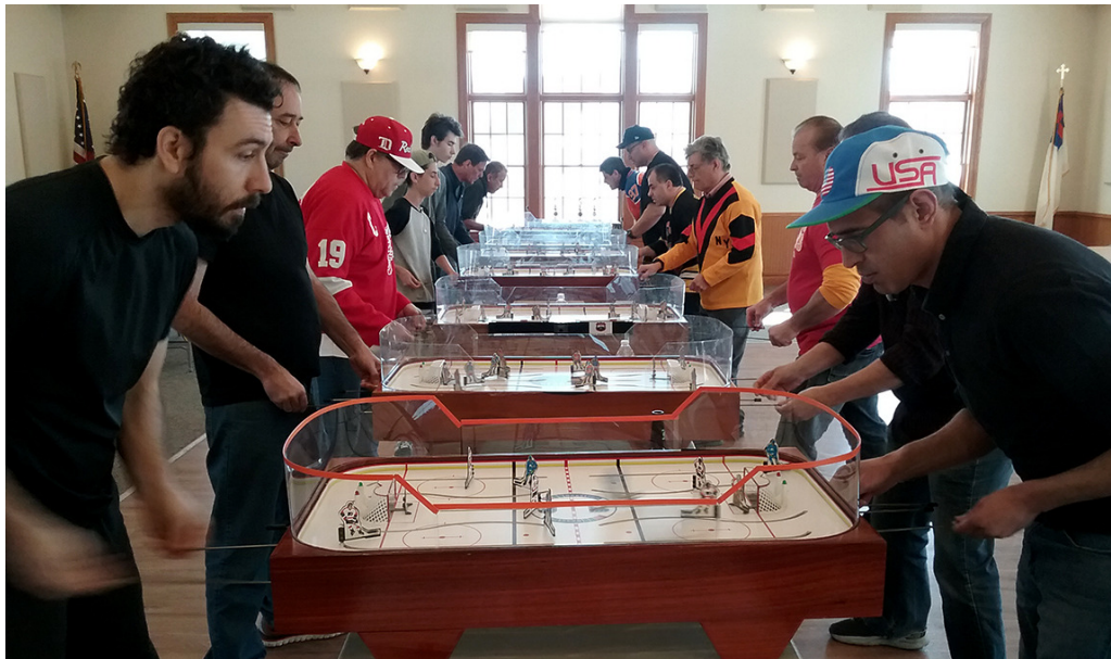
Round-robin action: fast and furious