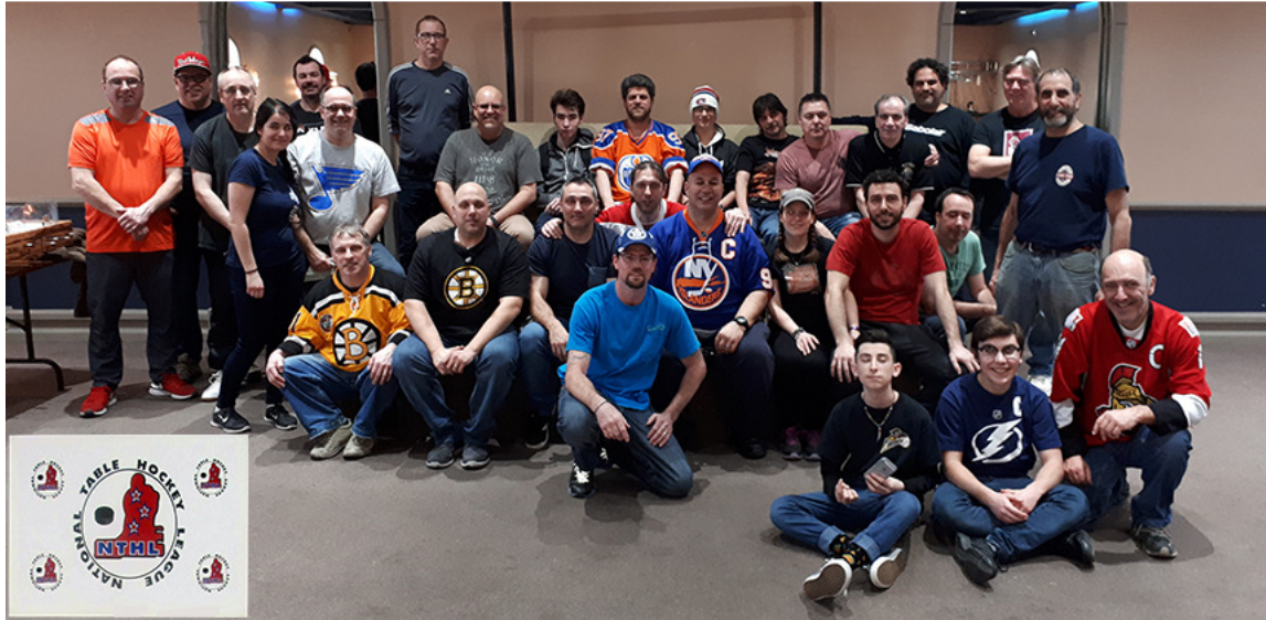
Montreal, February 24, 2018