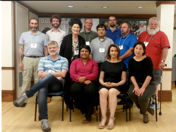
APPA Certification Program, July 8-10, 2016, New York