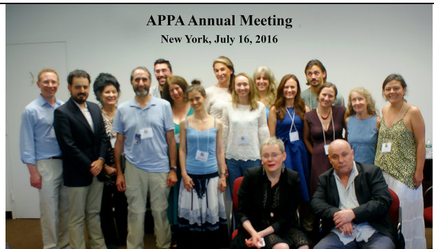
APPA Annual Meeting New York, July 16, 2016