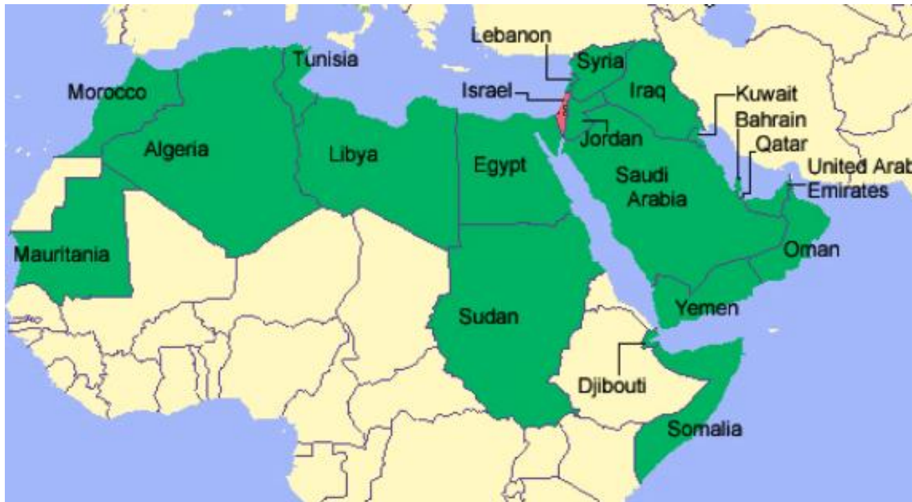
Figure 14.5 The “Arab world” and Israel