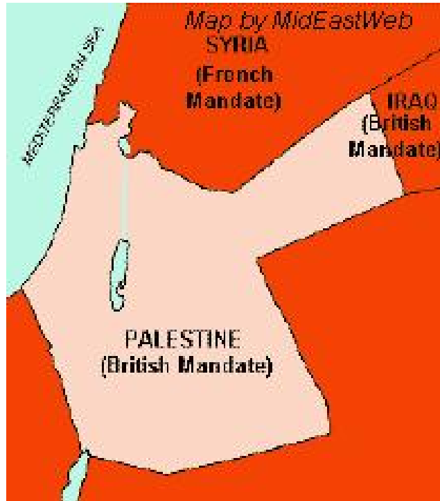
Palestine in 1918, after World War I