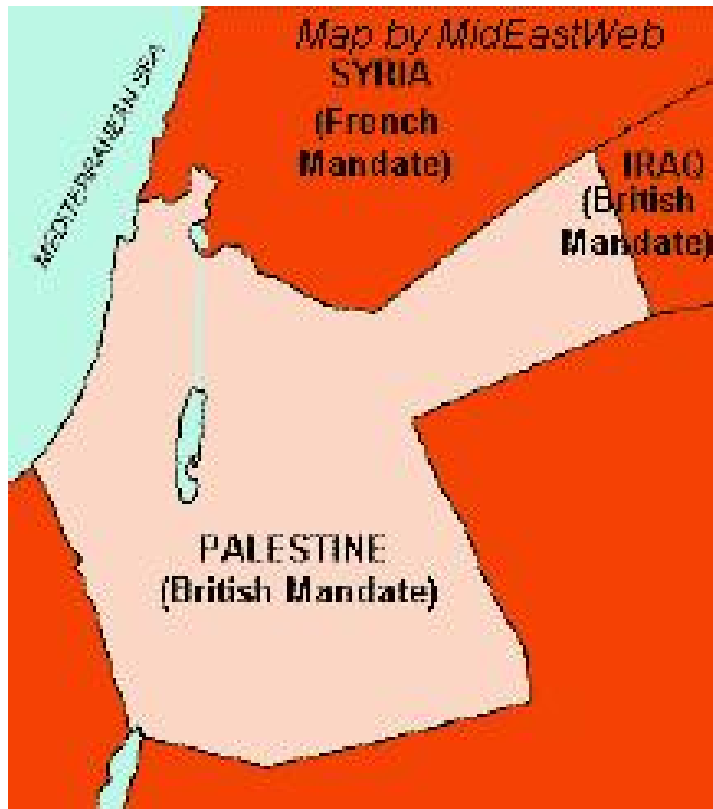
Figure 14.1 Palestine in 1918. British and French Mandates