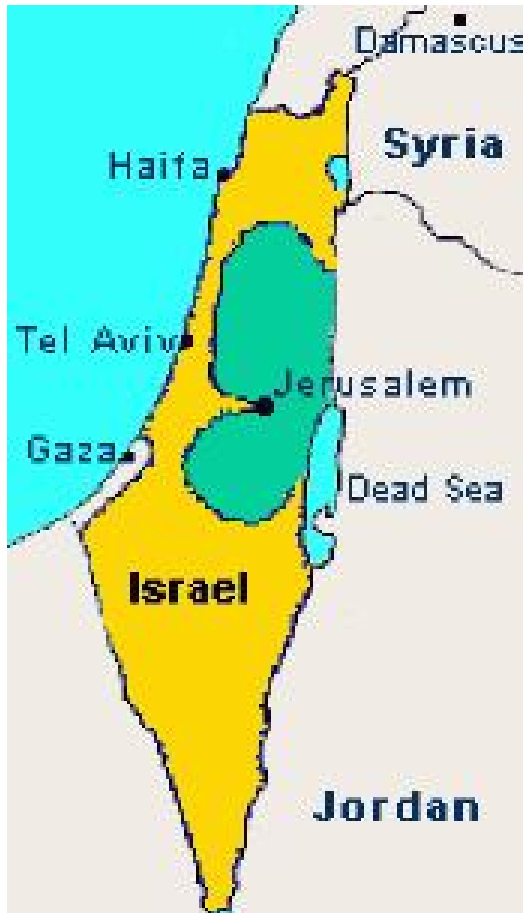
Figure 14.4. Israel in 1948