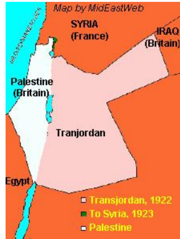
Palestine in 1922, after the first British partition