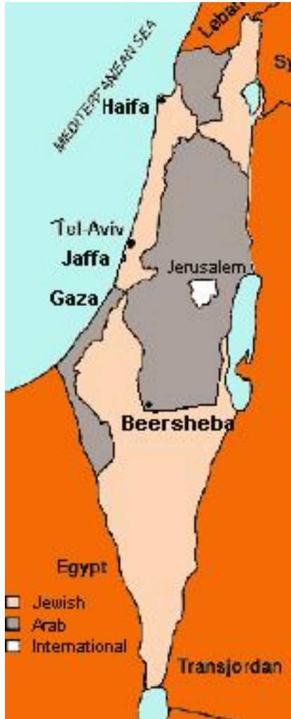
Figure 14.3 Palestine in 1947

This British partition was approved by United Nations Resolution 181 (November 1947).