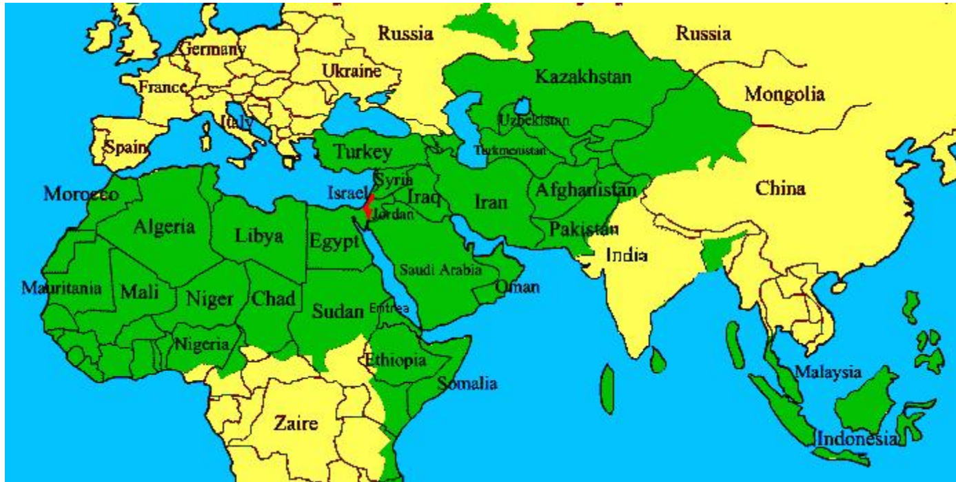
Figure 14.6 The “Islamic world,” Israel, and the civilizational interface between Islam, East Asia, India and Europe.